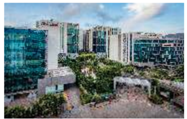
MINDSPACE AIROLI WEST