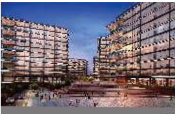
GERA COMMERZONE KHARADI