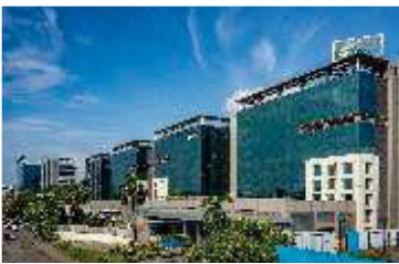
MINDSPACE AIROLI EAST